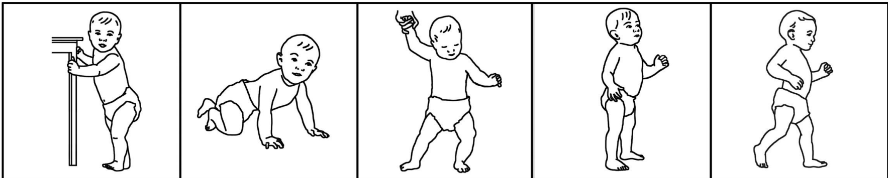
6. Stands holding furniture (9 months)